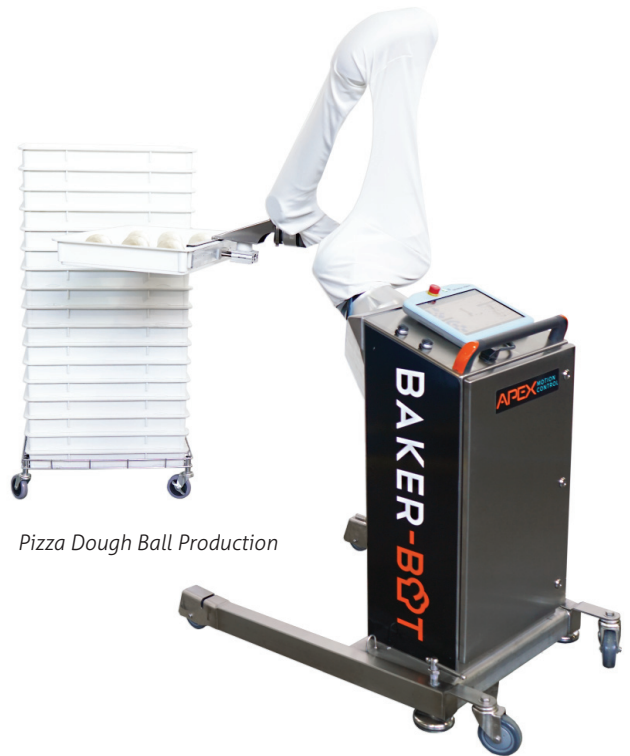
Pizza Dough Ball Production